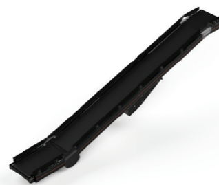
CT02 Belt Conveyor Incline 400V