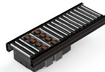
KP01 Pop-up Module 24V