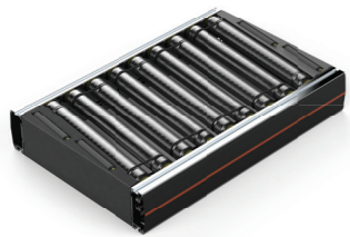
CT01 Roller Conveyor Alignment 24V