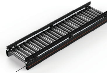
CT01 Roller Conveyor Straight 24V