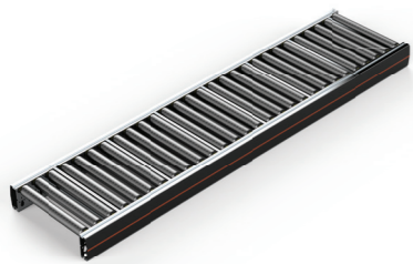
CT01 Roller Conveyor Straight Non Driven