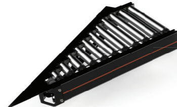
CT01 Roller Conveyor Merge 24V