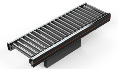
CT01 Roller Conveyor Straight General 400V