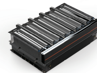
KP02 Transfer Module 24V