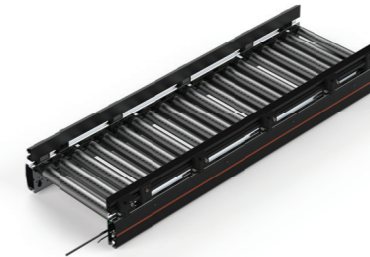
CT01 Roller Conveyor Straight Accumulating 24V